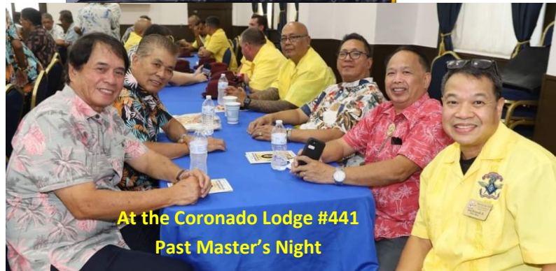
At the Coronado Lodge #441 Past Master's Night