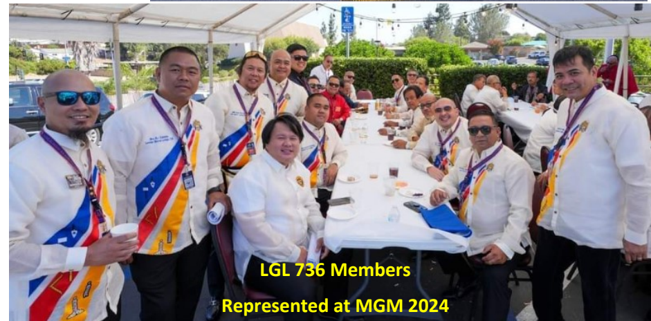
LGL 736 Members Represented at MGM 2024