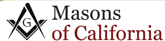
Chart Our Path Forward at the 175th Annual Communication

At the Annual Communication, the Masons of California gather for business and fun.